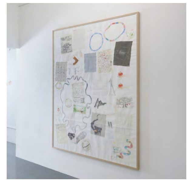
Manuscripts for Final Work "Swan Song A" 01 2019 Watercolor, acrylic, colored pencil, ballpoint pen on paper 179 x 127 cm