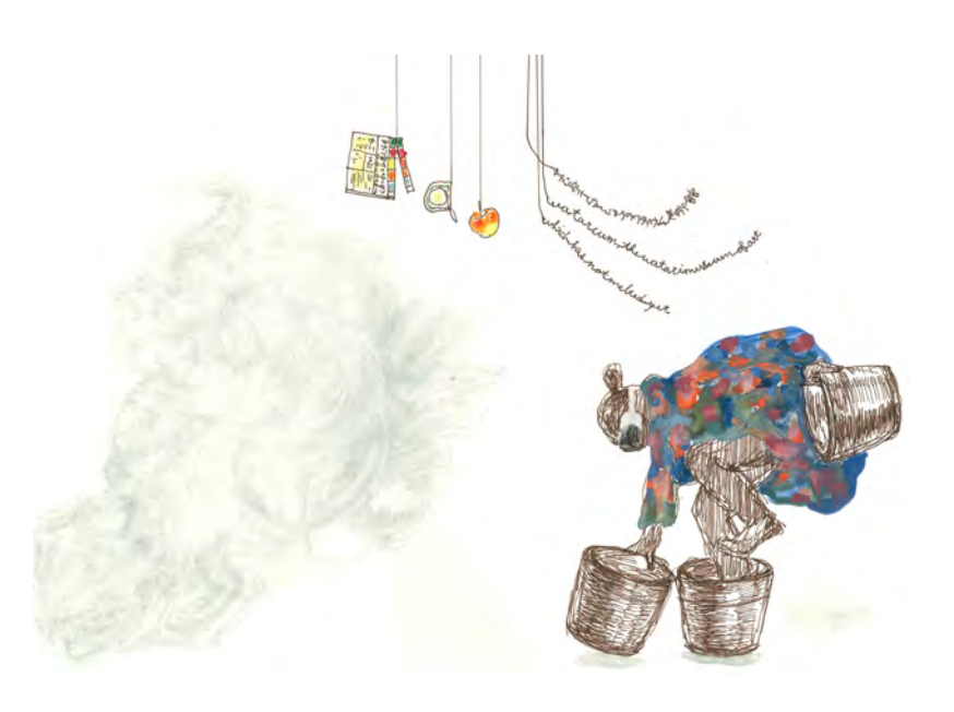
Drawing for the latest VR work, 2024

In this exhibition, a glass table on which many sculptures of melted apples are placed, which also serves as a light box and can hold drawings and other objects, will be lit from the atrium directly above the sculptures. A video explaining "Why Amemiya is making melted apples = Universality 2.0," which has never been discussed in short before and is related to the title of this exhibition, will be shown on the table.