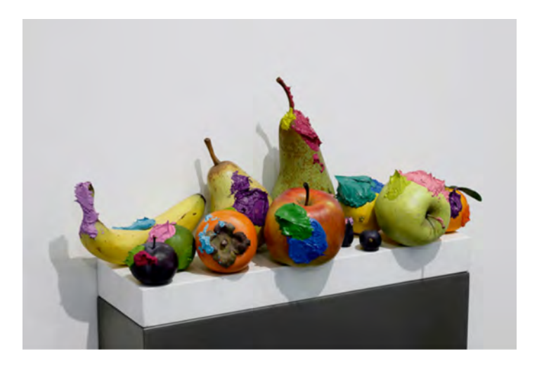
Fruits (About Universality), 2020, 35x47x16cm, Oil paint on wood, stainless steel base

Sculptures on V and R in the earliest practice, including a work in which the surface of a stuffed bear is painted on the sculpture in the form of a stuffed bear.