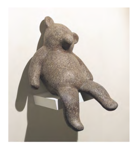
A Sign of Nothing, 2000 Mixed technique of tempera and oil paint on FRP, base

Sculptures on V and R in the earliest practice, including a work in which the surface of a stuffed bear is painted on the sculpture in the form of a stuffed bear.